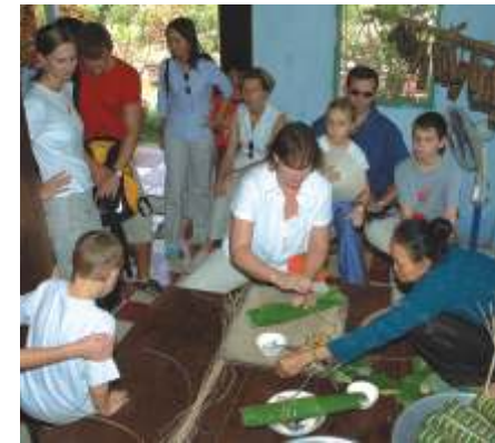
Wrapping "Banh Tet" - Can Tho