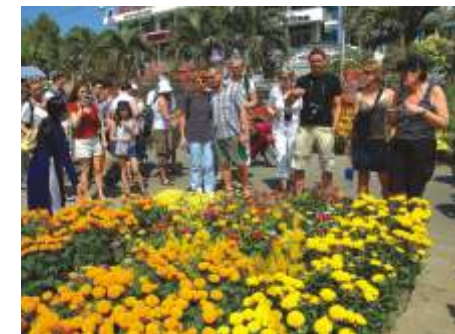
Street of Flowers - My Tho

Spring time in the south is also the time in which apricot blossoms are in bud. The yellow colour of the flowers blooming at first moments of the New Year is believed to bring good luck, fortune and longevity to all. That is why the apricot blossom heralds spring in the south. Joining Saigonese and sharing the pervasive "Tet" atmosphere in every nook and cranny of the largest and most dynamic city in Vietnam will be an unforgettable experience to all foreign visitors. The tour features Tet flower fairs, pagodas, a pedicab ride (1 hour) and a visit to a local home with traditional dishes. The trip is applicable only on the Tet occasion of the Year of the Ox from January 26 - 29, 2009 (Lunar New Year's day 1 - day 4).