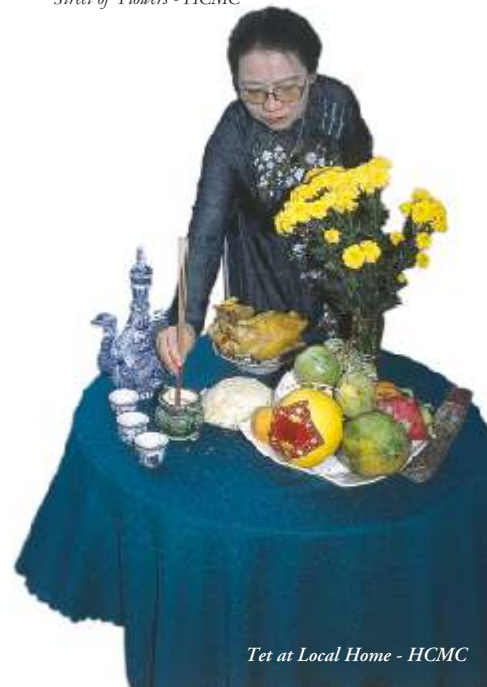
Tet at Local Home - HCMC