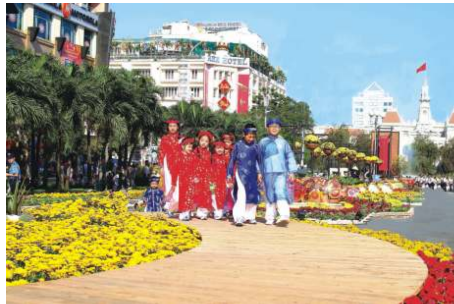
Street of Flowers - HCMC