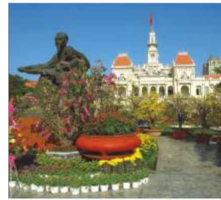
City Hall in Tet - HCMC

Note: the trip is applicable only on the Tet occasion of the Year of the Ox from January 18 - 25, 2009 (last lunar month's day 23 - day 30).