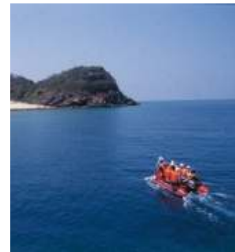
Con Dao Island