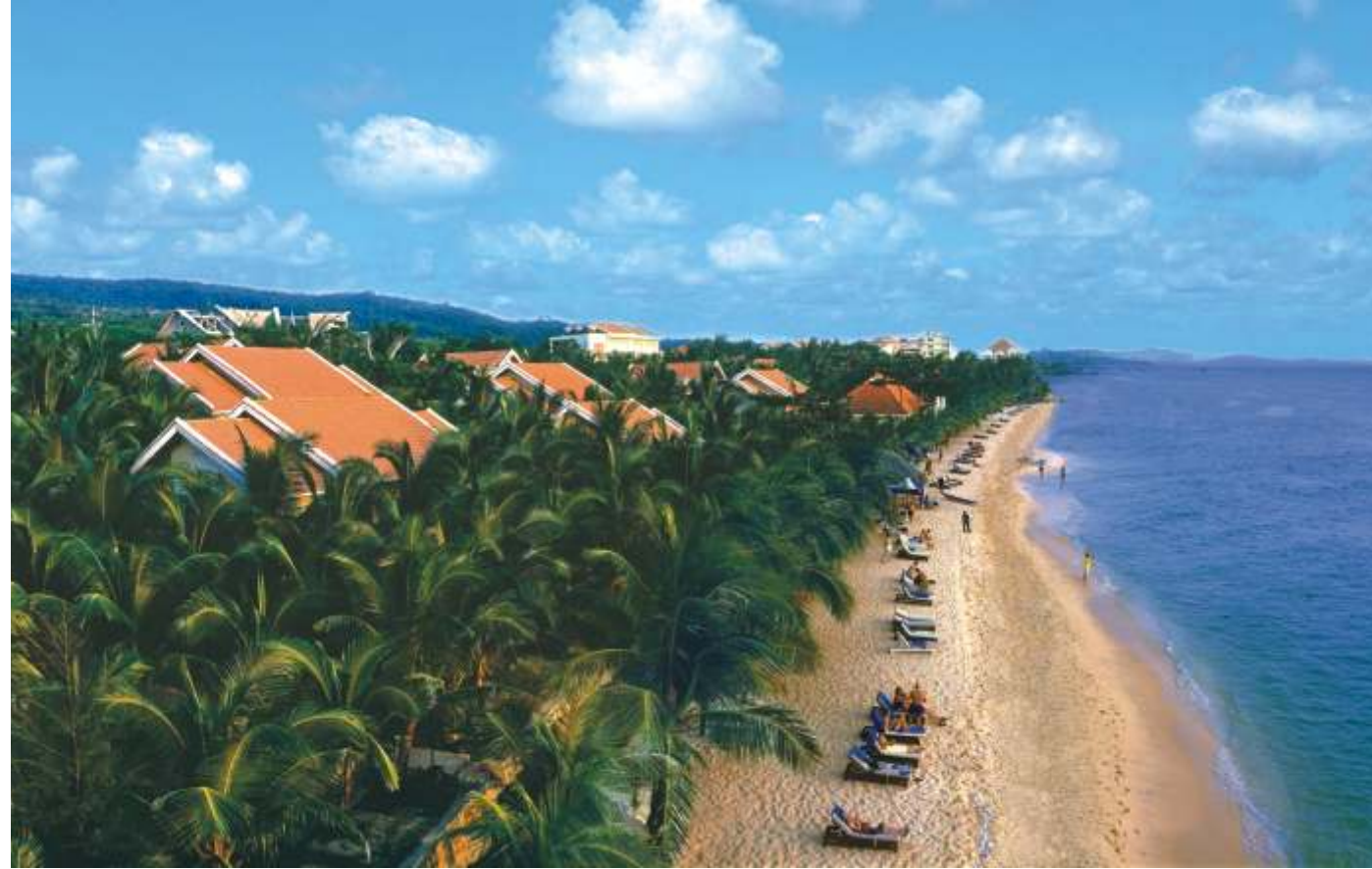
Phu Quoc Beach