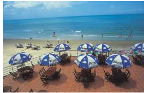
Vung Tau beach