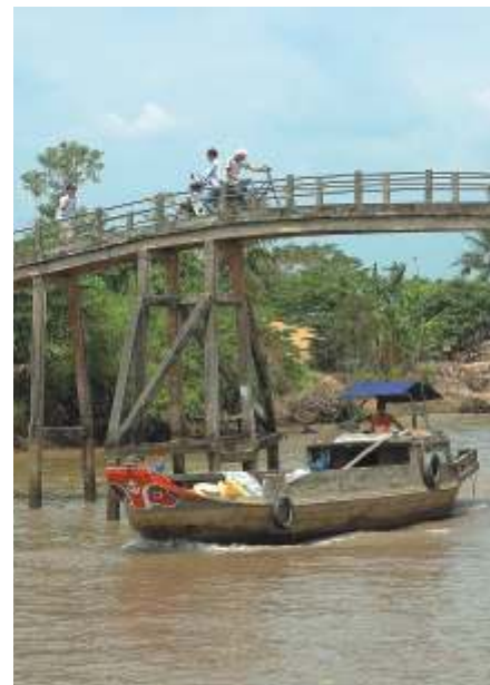
Riverine Life - Vinh Long

After breakfast get on board Cai Be Princess to start the cruise journey from Dong Hoa Hiep Islet to An Binh Islet, a peaceful escape where you will be able to discover