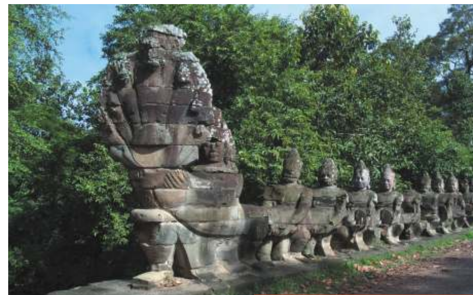
Southern Gate of Angkor Thom - Siem Reap