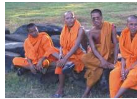
Buddhist Monks - Siem Reap

In the morning explore the famous 12 th -century temples of Angkor Wat, with their five distinctive towers emblazoned on the Cambodian flag. Angkor Wat's five towers symbolize Meru's five peaks - the enclosed wall represents the mountains at the edge of the world and the surrounding moat, the ocean beyond. In the afternoon pay visit to the ancient capital of Angkor Thom (12 th century) which comprises the South Gate, the Royal Enclosure, Phimeanakas, the Elephants Terrace, the Terrace of the Leper King and the famous Bayon Temple, unique for its 54 towers decorated with over 200 smiling faces of Avolokitesvara. Late in the afternoon transfer to the airport for departure flight.