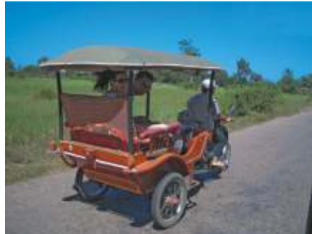
Southern Gate of Angkor Thom - Siem Reap