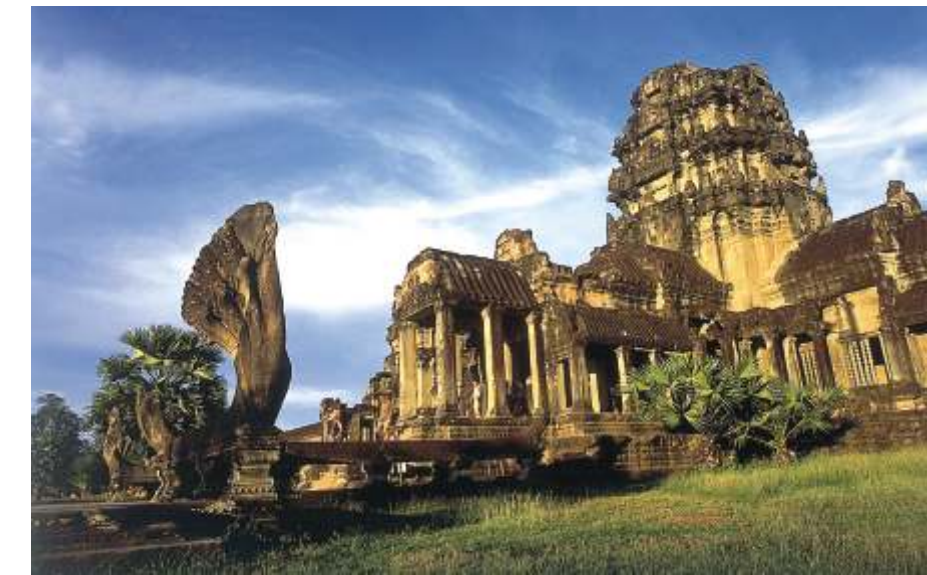
Angkor Wat - Siem Reap