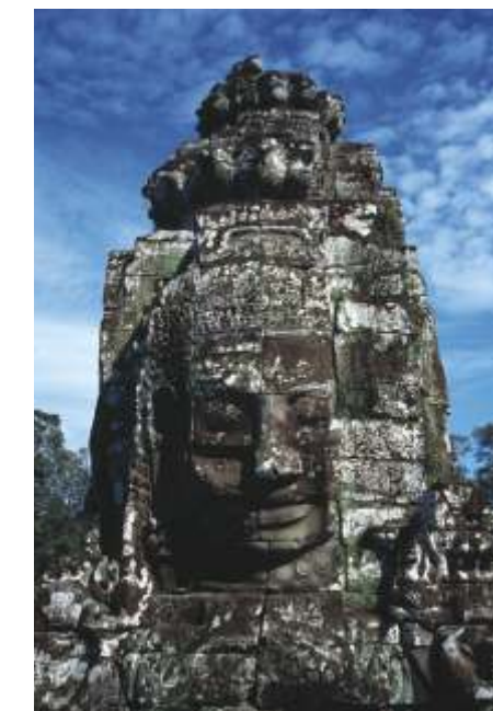
Bayon Temple - Siem Reap

Spend last minutes shopping until transfer to the airport for departure.