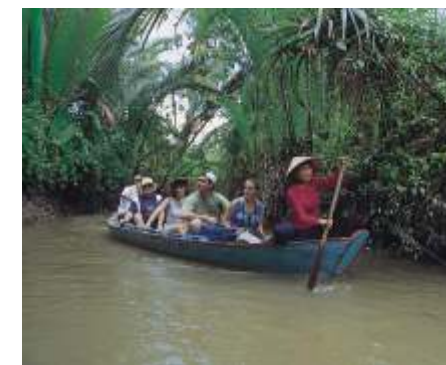
Saigon ride - Mekong Delta

Start a morning drive back Bac Ninh, a cradle of traditional culture in the Red River Delta. Visit Phu Lang ceramic village. This old pottery village is worth visiting not only because you can meet and make friends with the locals and make original gifts for