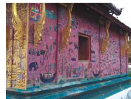
Decorations at Wat Xiengthong - Luang Prabang

Enjoy a unique sight of the early morning ritual parade of saffron-clad monks collecting offerings of alms (ubiquitous sticky rice) from the faithful residents and visitors, and from there have a leisurely stroll around the nearby morning market, where you will see such diverse offerings as dried buffalo skin, local tea and saltpeter among the chickens, vegetables and hill-tribe weavings. Then pay visits to the city's oldest temple of Wat Sene and the magnificent Wat Xiengthong with its roofs sweeping low to the ground, which represent the classical architecture of Luang Prabang temple. Next, board a traditional river boat cruising upstream the Mekong River for the sacred Pak Ou Caves. Enjoy the beautiful mountain landscape, the tranquil countryside along the journey. On arrival, explore the mysterious Pak Ou Caves, crammed with thousands of gold lacquered Buddha statues of various shapes and sizes. After the river trip, drive to Ban Xang Khong village to see how traditional Sa paper is made. Stay overnight in Luang Prabang.