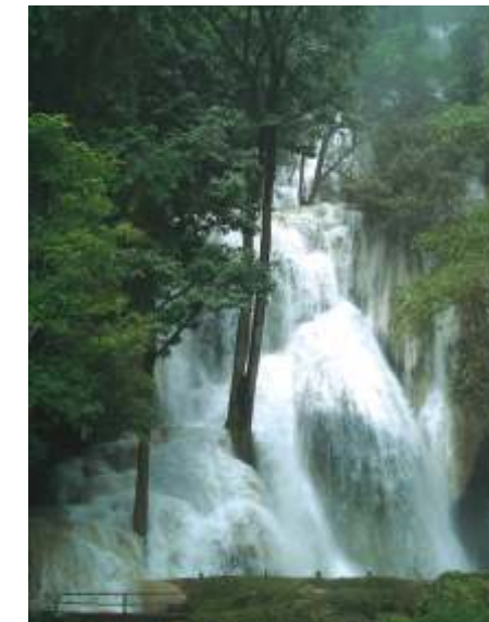
Khuang Xi Waterfalls - Luang Prabang

Visit the National Museum (former King's Palace) where displays a collection of personal artifacts of the Royal Family, including photos, musical equipment and gifts received from foreign countries. Then drive to the famous hand-weaving village of Ban Phanom. Spend last minutes shopping before check-out. Transfer to the airport for departure flight.