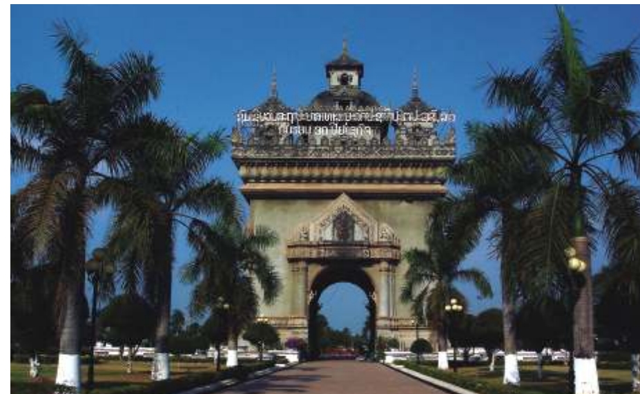
Victoria Gate - Vientiane