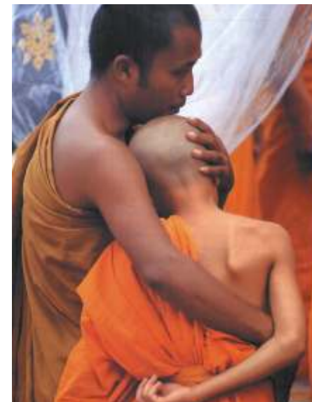
NB: B: breakfast, L: lunch, D: dinner.