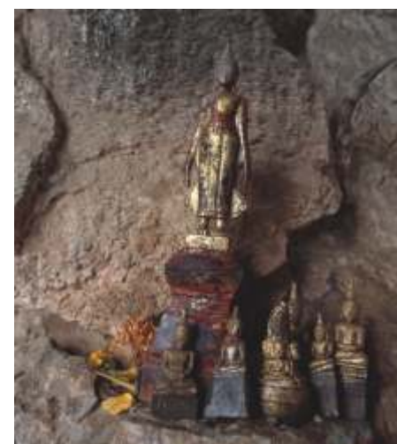
Buddha Statues in Pak Ou Cave - Luang Prabang

Enjoy a unique sight of the early morning ritual parade of saffron-clad monks collecting offerings of alms (ubiquitous sticky rice) from the faithful residents and