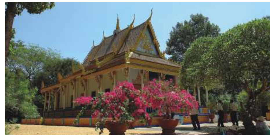
Bat Pagoda - Soc Trang

Note: The tour itinerary is sometimes subject to small modifications depending on weather and road conditions, flight/train schedules, hotel room availability.