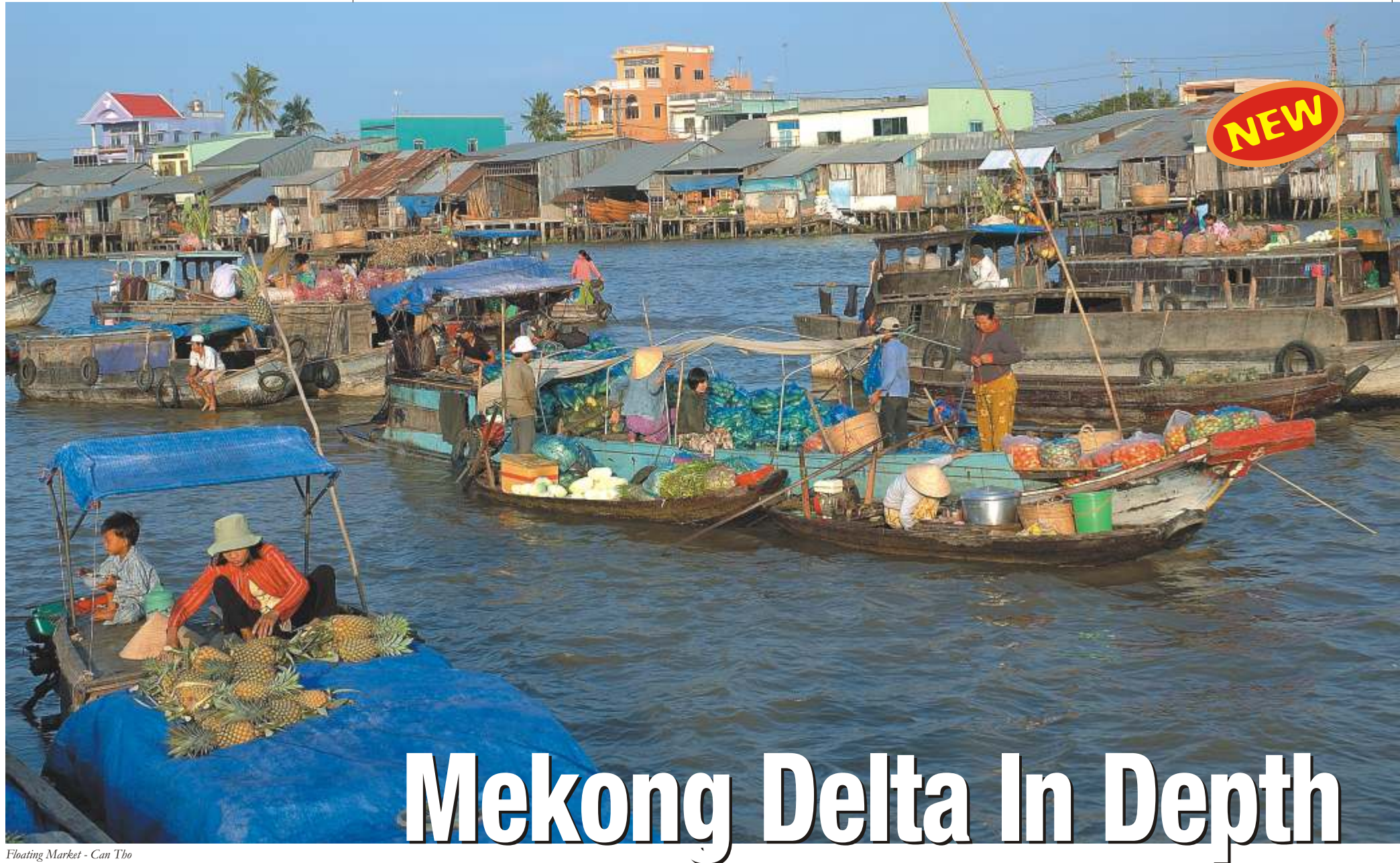
Floating Market - Can Tho