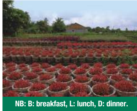
Flower Village of Tan Quy Dong - Sa Dec

Take a boat ride to Long Xuyen floating market where you can view local people selling and buying vegetables, fruits, etc. in daily life. Leave Long Xuyen for Chau Doc with stops-over at an incense stick making village and a crocodile breeding farm on the way. In the afternoon, enjoy a boat cruise on the Mekong River and get to know the feeding of catfish in their natural river habitat at floating houses. Continue cruising to visit Chau Giang Hamlet, home to colorful brocade woven on wooden looms by Cham ladies. Then drive to visit Lady Xu Temple,