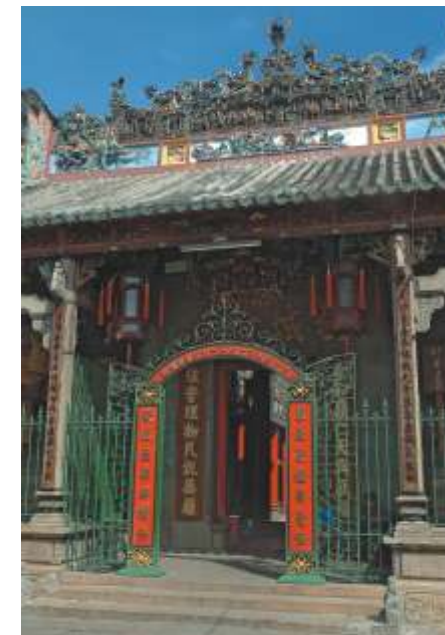
Thien Hau Temple - HCMC