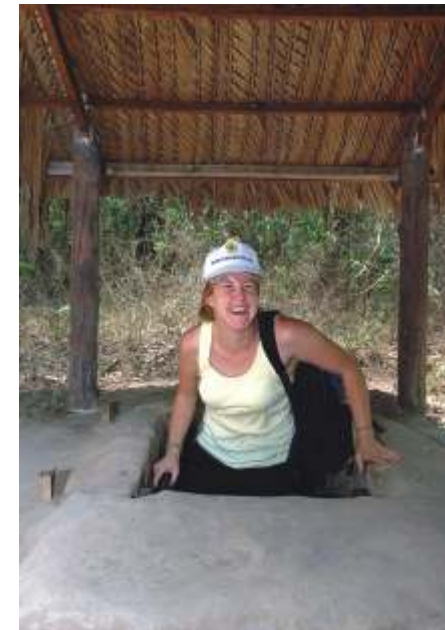
Cu Chi Tunnels - HCMC