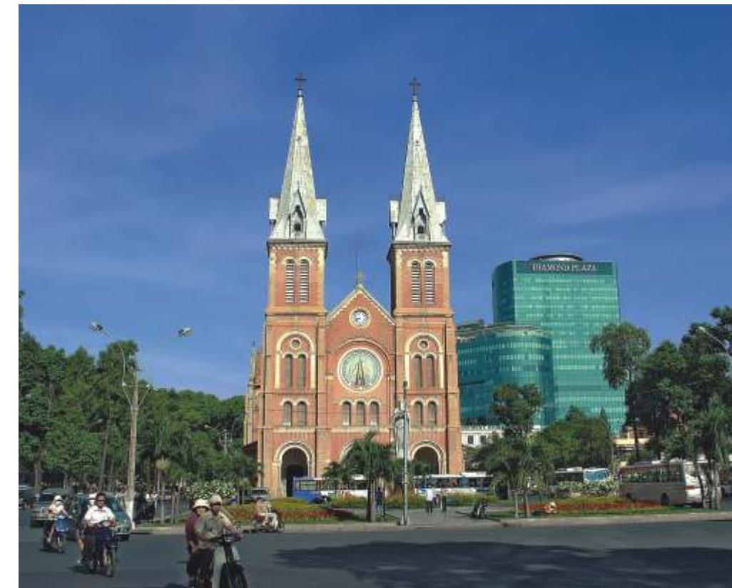
Notre Dame Cathedral - HCMC

Visit the Reunification Palace (the former Presidential Palace) and the Central Post Office. The next stop is Emperor of Jade Pagoda, built in 1900 and dedicated to the worship of the supreme god and other deities. Visit Fine Arts Museum which displays art works from the classical period to socialist realist and contains artifacts from the ancient civilizations of Oc Eo. Have short walk along the antiques shop street of Le Cong Kieu before visiting the famous Ben Thanh market, a popular emblem of Saigon.