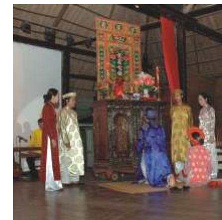
Traditional Wedding Show - Binh Quoi