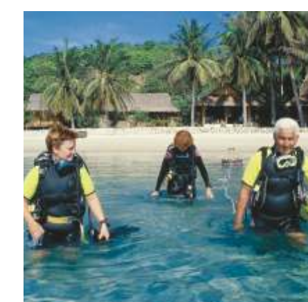
Scuba Diving - Nha Trang

Note: The good season is from February through October.