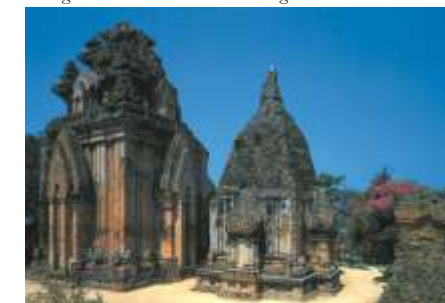
Cham Towers - Nha Trang