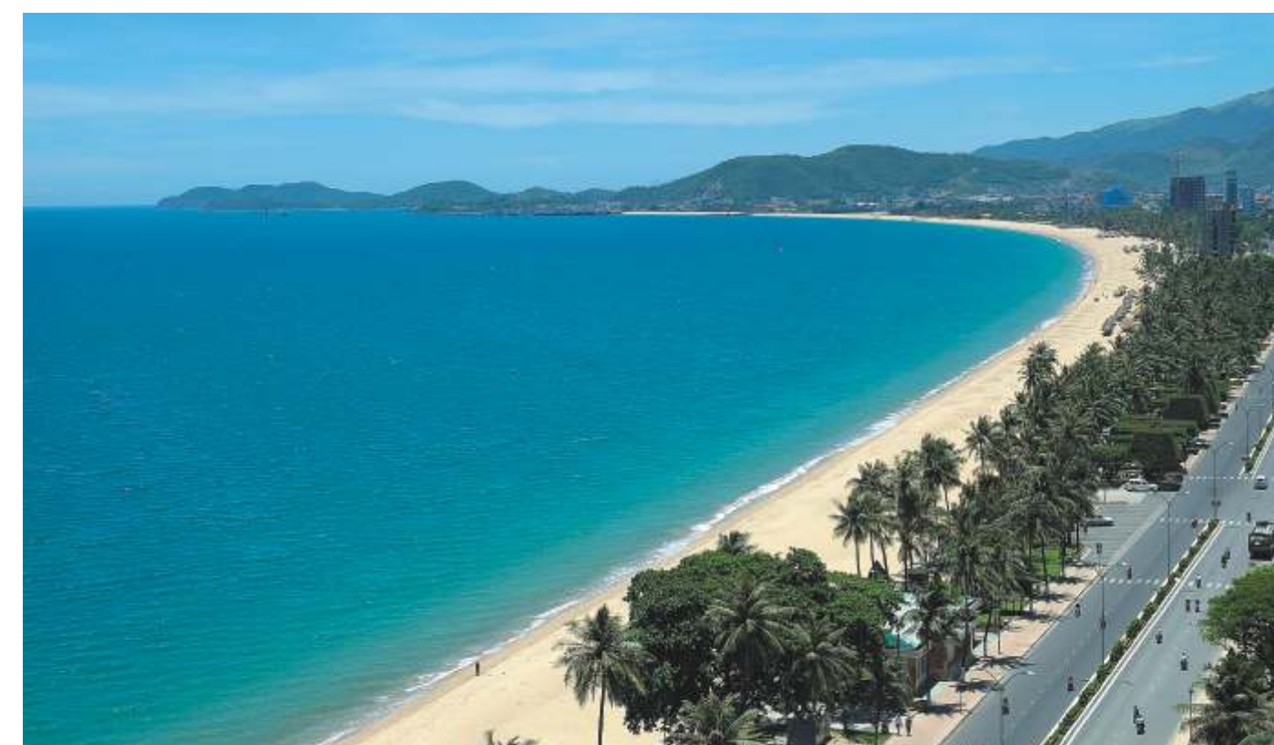
Nha Trang Beach