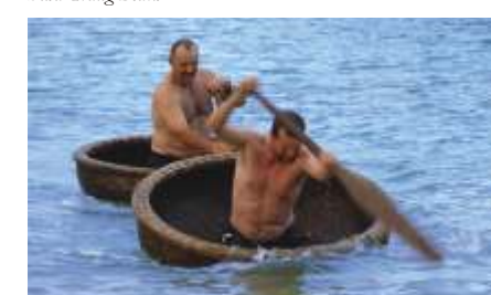
Riding Local Basket Boat- Nha Trang