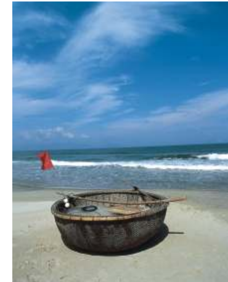
Dong Hoi Beach

Buddhist shrines and the stone-carving village of Non Nuoc. Then proceed to Hoi An ancient town, a major Asian trading port in the 17 th and 18 th centuries. Relax at one of the most beautiful beaches of Vietnam and enjoy the hotel/resort facilities or rest of the day. Stay overnight in Hoi An.