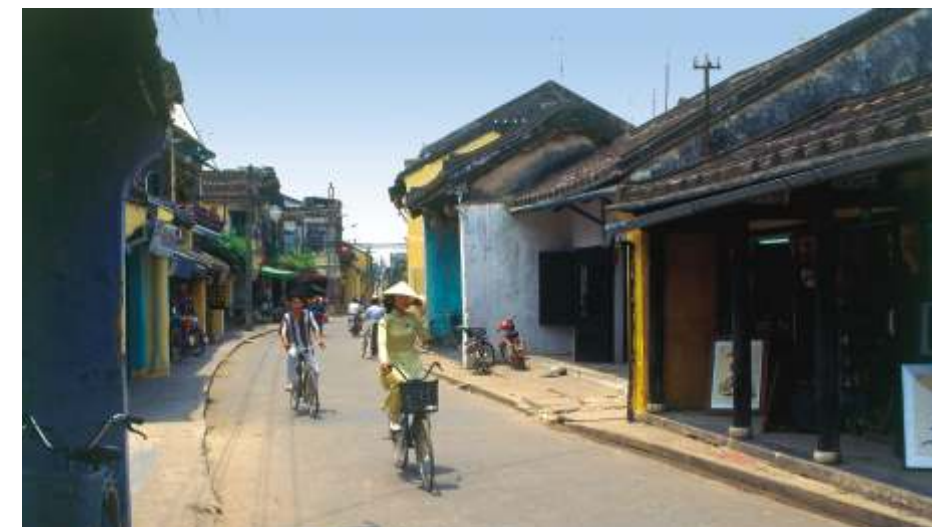
Hoi An Ancient Town