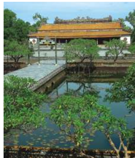
Palace of Supreme Harmony - Hue

Drive for Quang Tri town where you can see some war remnants and the original ramparts and gates of former Quang Tri Citadel. Stop over at Ben Hai River, formerly known as a demarcation line between the North and the South of Vietnam. Then proceed to Vinh Moc with the amazing 2.8 km of underground tunnels, dug to accommodate an underground village safe from American air raids in the north of the DMZ. Continue driving through the sites of the former fierce battle fields of Dong Ha, Doc Mieu and Vinh Linh before arriving in Dong Hoi. Stay overnight in Dong Hoi.