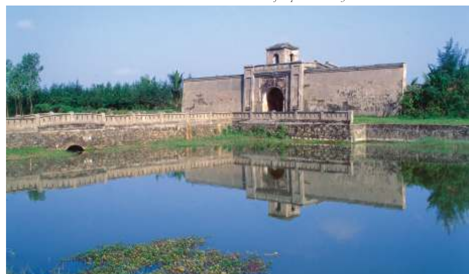
Ancient citadel - Quang Tri

Saigontourist representative will greet and pick you up at Danang airport on arrival. Depart for Hue by a scenic drive via the Pass of Ocean Clouds and the scenic fishing village of Lang Co. Enjoy the beautiful landscapes and panoramic views of the clouds, the sea and the mountains during the journey. On arrival in Hue, the former imperial capital of Vietnam, have a panorama tour of Hue before driving to your hotel for check-in. Optional with surcharge: Enjoy a Hue folk show on a barge on the Perfume River in the evening. Stay overnight in Hue.