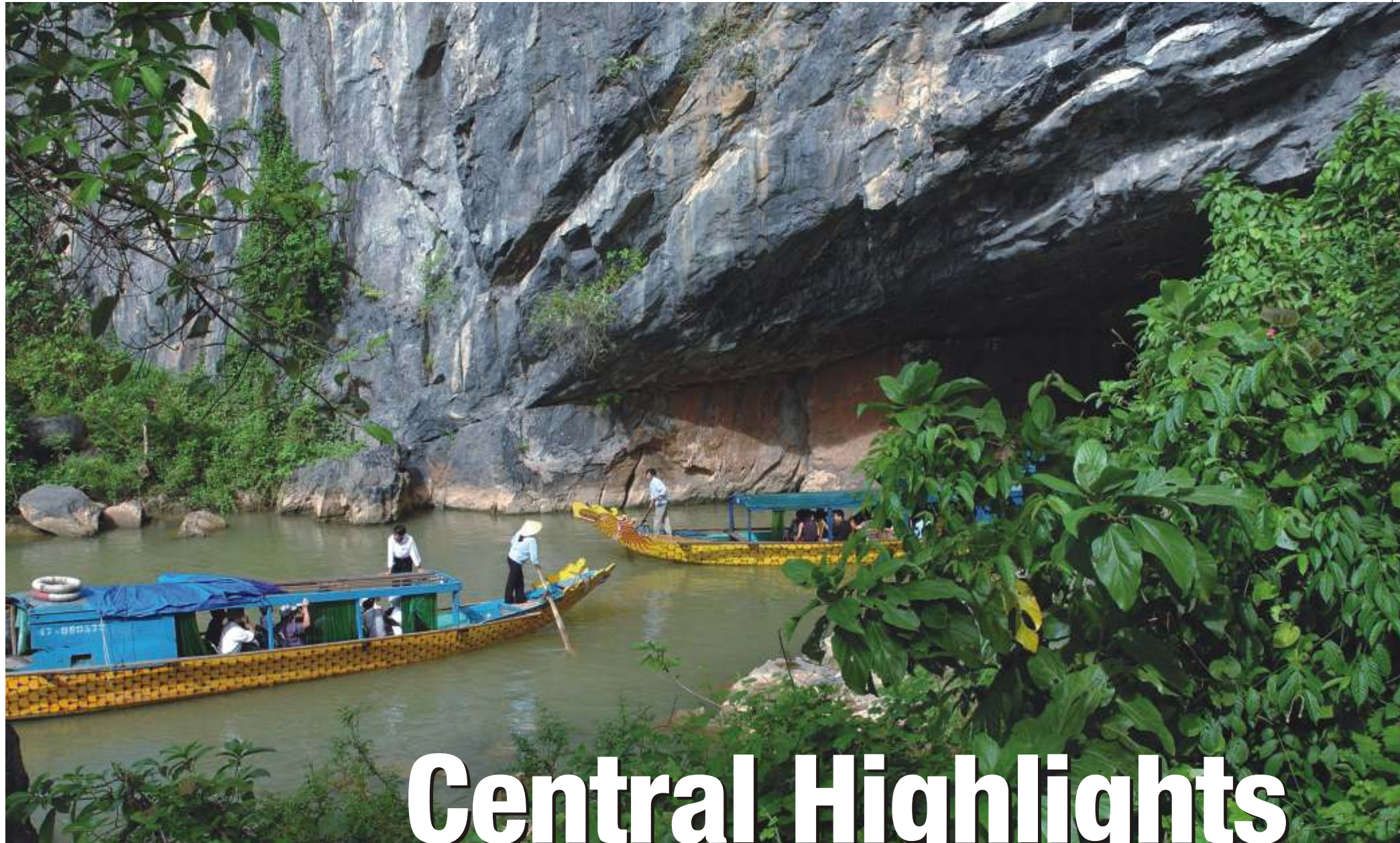
Phong Nha Cavern