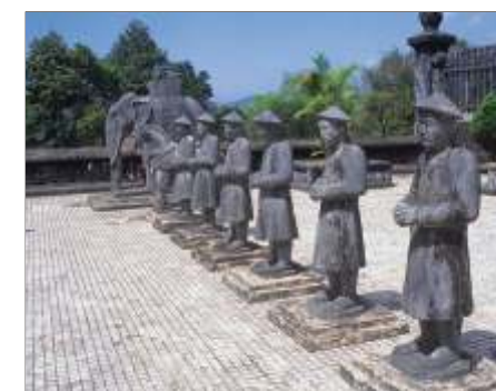
Mausoleum of King Khai Dinh - Hue

Visit the Mausoleum of King Minh Mang (1820-1840), which consists of about 40 monuments of various dimensions and was built by some 10,000 soldiers and workers in four years (1840-1843). The next stop is Thien Mu Pagoda, one of the oldest ancient architectural structures for religious worship in Hue. Then return to your hotel by a traditional boat cruise along Perfume River. Pick up and drop off at your hotel.