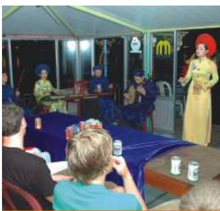
NB: B: breakfast, L: lunch, D: dinner.