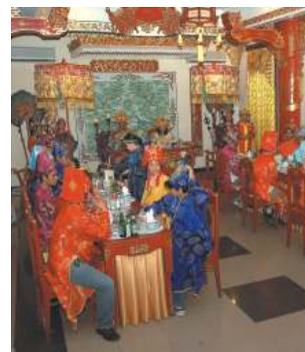
Hue Royal Music & Dinner