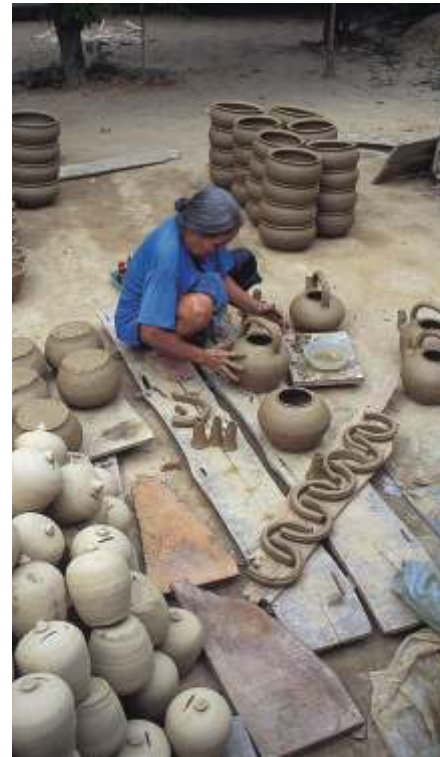
Thanh Ha Earthenware Village - Hoi An