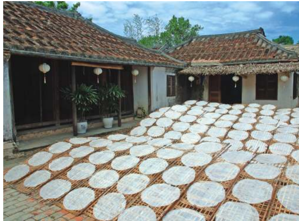
Making Rice-Paper - Hoi An