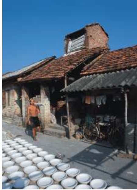
Bat Trang Pottery Village - Hanoi

Day 1: Arrival in Hanoi (-, -, -) Saigontourist representative will greet and pick you up at Noi Bai airport in Hanoi. Located on the banks of the Red River, Vietnam's capital is a stylish and gracious city that retains a unique old world charm and has some of Asia's most striking colonial architecture. Transfer to your hotel for check-in. Enjoy an evening water puppet show, a theatrical genre reflecting the agricultural civilization of thousands of years ago. Stay overnight in Hanoi.