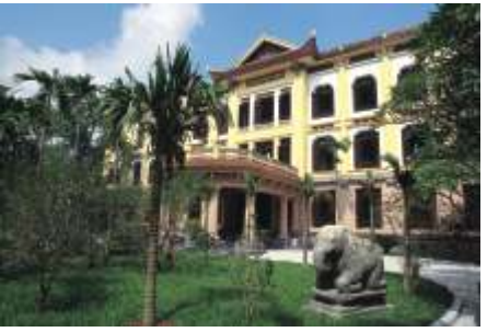
Vietnam Fine Arts Museum - Hanoi

Day 3: Departure from Hanoi (B, -, -) Spend last minutes shopping before check-out. Transfer to the airport for departure.