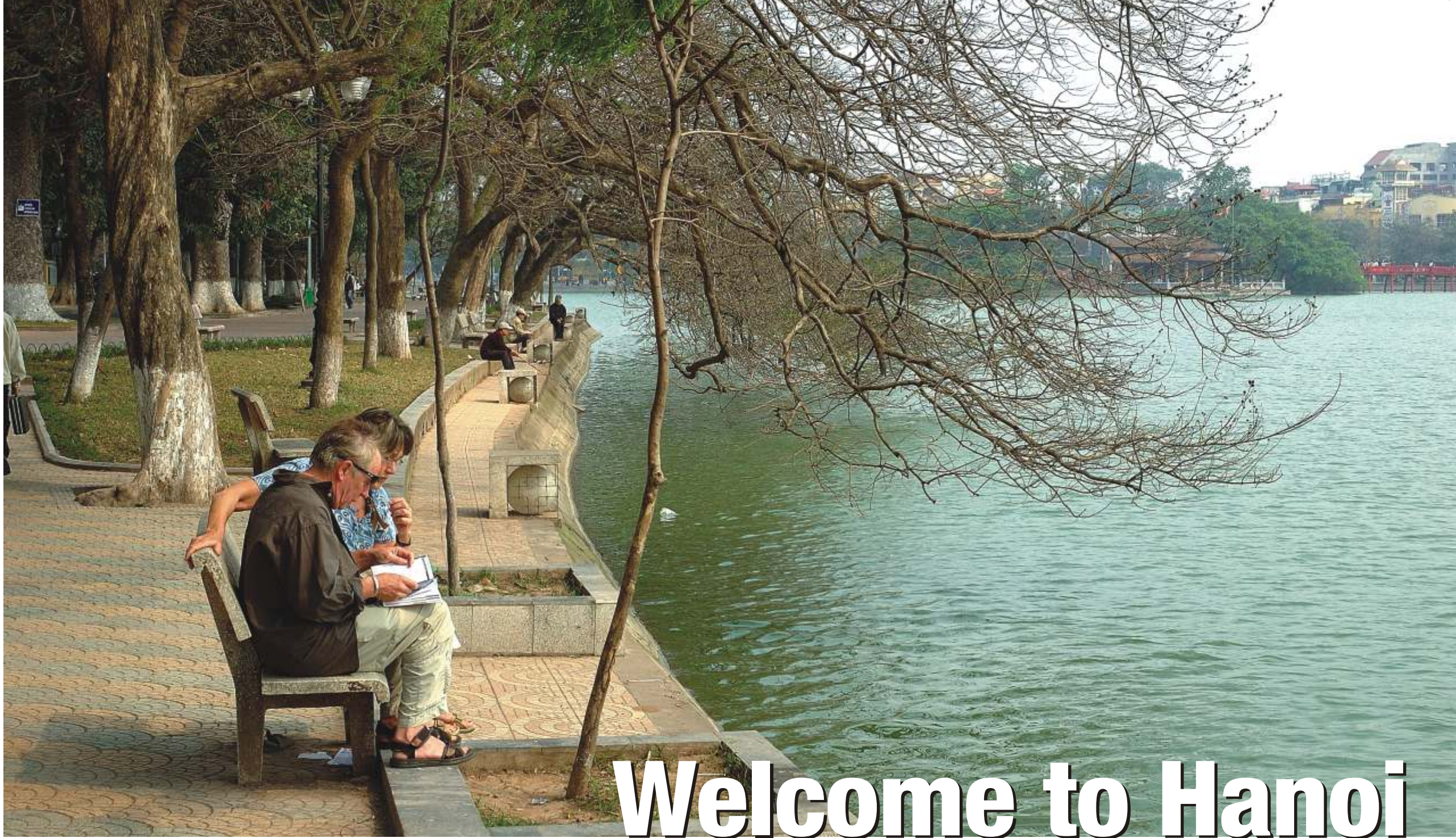
Lake of Restored Sword - Hanoi

Day 2: Hanoi (B, -, -) Enjoy a full day tour of Hanoi with cultural and historical highlights, comprising Lake of Restored Sword, Ngoc Son Temple, the Temple of Literature, the Ethnology Museum (closed on Monday) and a downtown pedicab ride (1 hour) round the old quarters of Hanoi, a collection of narrow streets, each named after the product sold. Afternoon visit to Vietnam Fine Arts museum (closed on Monday) and then drive to the famous Bat Trang pottery village with a history of 500 years. Observe the artisans forming, painting and glazing their products, which are then baked for several days in huge kilns. Stay overnight in Hanoi.