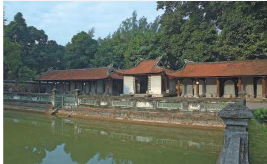
Temple of Literature