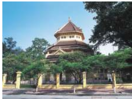
History Museum - Hanoi

Day 1: Arrival in Hanoi (-, -, -) Saigontourist representative will greet and pick you up at Noi Bai airport in Hanoi. Located on the banks of the Red River, Vietnam's capital is a stylish and gracious city that retains a unique old world charm and has some of Asia's most striking colonial architecture. Transfer to your hotel for check-in. Enjoy an evening water puppet show, a theatrical genre reflecting the agricultural civilization of thousands of years ago. Stay overnight in Hanoi.