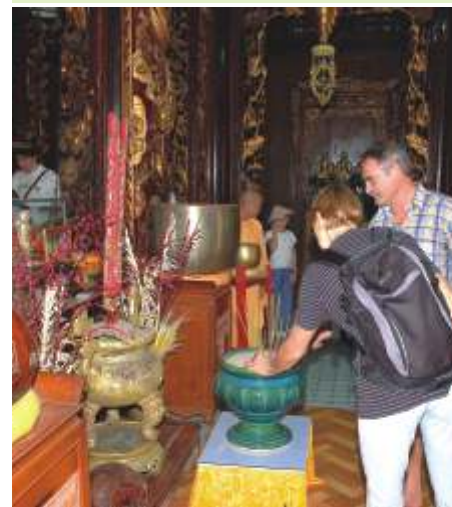
Vinh Trang Pagoda - My Tho

Take a bike ride to Ben Tre (12km) past coconut gardens, creeks and ponds. Then visit an elementary school and the Ben Tre Market. Have lunch en route. In the afternoon join the locals in their farm work such as ploughing, sowing, reaping, etc. Have dinner and accommodation at a local home.