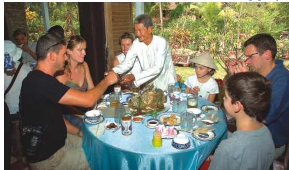
Have Lunch at Local Home - Mekong Delta

Have a morning sightseeing tour of Ho Chi Minh. Visit the History Museum, the Reunification Palace, the Central Post Office, then have a short walk along the shopping Dong Khoi Street from Notre Dame Cathedral to the Municipal Theatre. Drive to bustling Cho Lon (Chinatown). Drop into the lively Binh tay