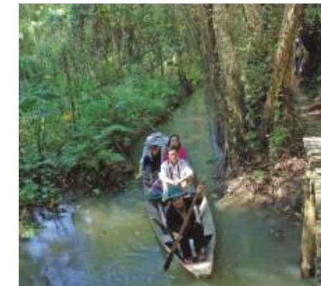
Xeo Quit Cajeput Forest - Cao Lanh

Go shopping (embroideries, lacquer ware, wood-carvings, etc.) before check-out. Transfer to the airport for departure.