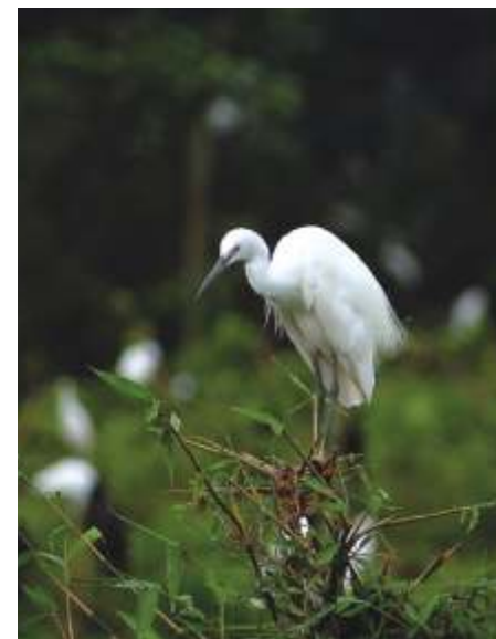
Bang Lang Stork Sanctuary - Can Tho

creeks and ponds to the Xeo Quit Cajeput Forest (10km). Lunch at Xeo Quit. Take a sampan cruise through a vast swamp under the canopy of a dense cajeput forest. Return to Ho Chi Minh City (130km) by coach. Stay overnight in Ho Chi Minh City.