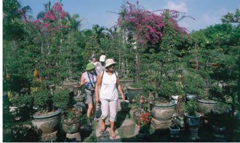
Visit Local Home - Mekong Delta