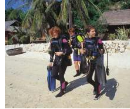
Diving in Nha Trang

Note: The good weather and clear water start in mid November and last until early June.