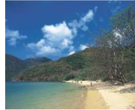
Con Dao Island